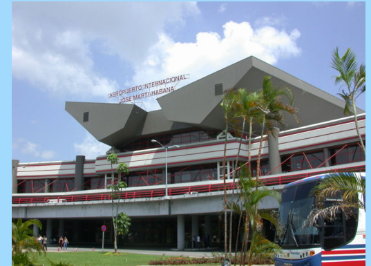
José Martí International Airport in Havana, Cuba