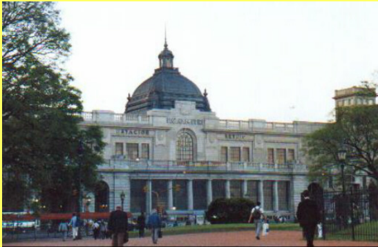
Argentine Railroad Station