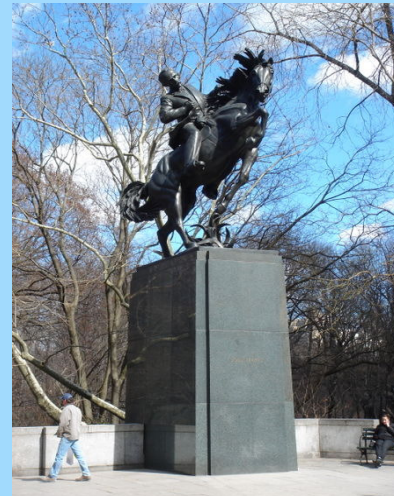
Statue of José Martí on horseback in New York's Central Park