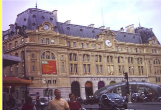
Paris Railroad Station